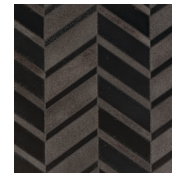
Glam Metallic Finish